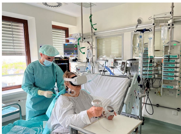
Fig. 3 VR application during ICU treatment to distract the patients

Due to discomforts such as aggressive noises, lights, and a lack of information, the intensive care units are often associated with negative feelings such as anxiety or stress for patients [7]. Merliot-Gailhoustet et al. investigated in a randomized trial E-CHOISIR (Electronic-CHOIce of a System for Intensive care Relaxation) the effects of different electronic relaxation devices on the reduction of overall discomfort, pain, anxiety, dyspnea, thirst, lack of rest feeling and stress in sixty ICU-patients. The patients received four relaxation sessions (standard relaxation with TV or radio, music therapy, and two VR systems with real or synthetic motion pictures). In the group with synthetic motion pictures the overall discomfort, pain, and stress could be significant decrease, while the real motion pictures were associated with a reduction in lack of rest. Both VR-Systems led to a significant decrease in anxiety. Three adverse events might occur: claustrophobia, dyspnea, and agitation. However, in general cybersickness (occurrence of symptoms such as headaches or nausea during VR use) rarely occurred [29].