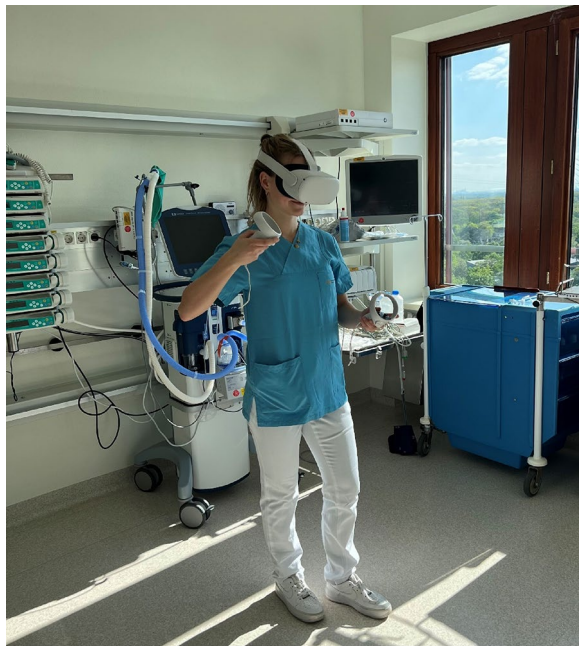
Fig. 2 VR application for the training of health care providers

but an inferior compression depth compared with face-to-face training [11]. The research on VR/AR in this field is generally very heterogeneous [12]. Wolff et al. developed a VR training environment to improve the traditional training for extracorporeal membrane oxygenation (ECMO) [5]. Bronchoscopy is another important tool for diagnostic and therapeutic purposes in ICU patients and performing this procedure can be challenging. Colt et al. created a virtual reality bronchoscopy simulation. Through the acquired skills after VR training, five novice physicians were comparable to four experienced physicians regarding dexterity, speed, and accuracy in the model [13]. In a prospective randomized study with 60 healthcare providers, Chiang et al. evaluated 15-min VR-based learning on tracheostomy care. The use of VR materials increased significantly participants' self-efficacy (increased familiarity, more self-confidence, and less anxiety) and the positive impact persisted until 3 to 4 weeks later [14].